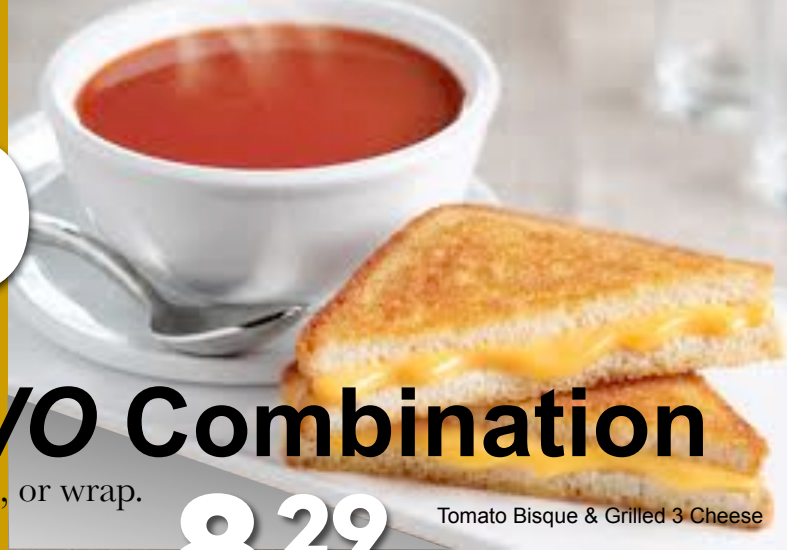
Tomato Bisque & Grilled 3 Cheese

Try our signature soup with a fresh salad, sandwich, or wrap.