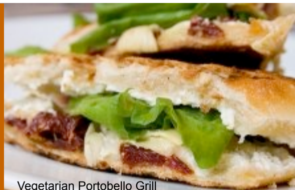
Vegetarian Portobello Grill