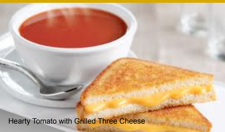
Hearty Tomato with Grilled Three Cheese

Top Seller Good 4 U Gluten Free Vegetarian