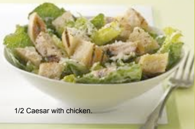
1/2 Caesar with chicken.

Our fresh salads are served with your choice of our fresh baked breads. * (sub fruit instead of the bread for Gluten Free add: .99c)