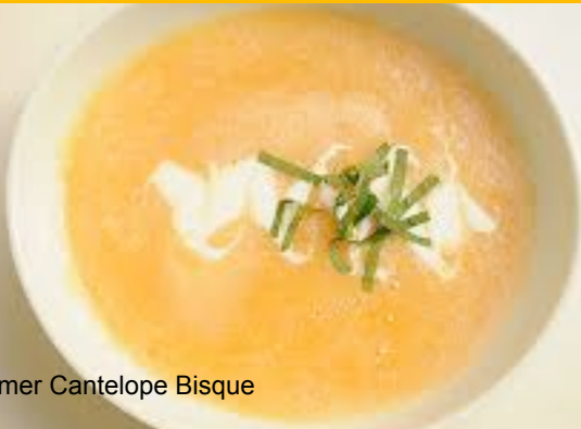
Summer Canteloupe Bisque

Top Seller Good 4 U Gluten Free Vegetarian