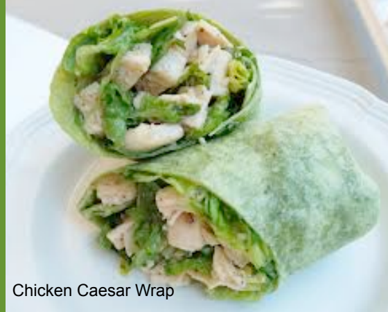
Chicken Caesar Wrap